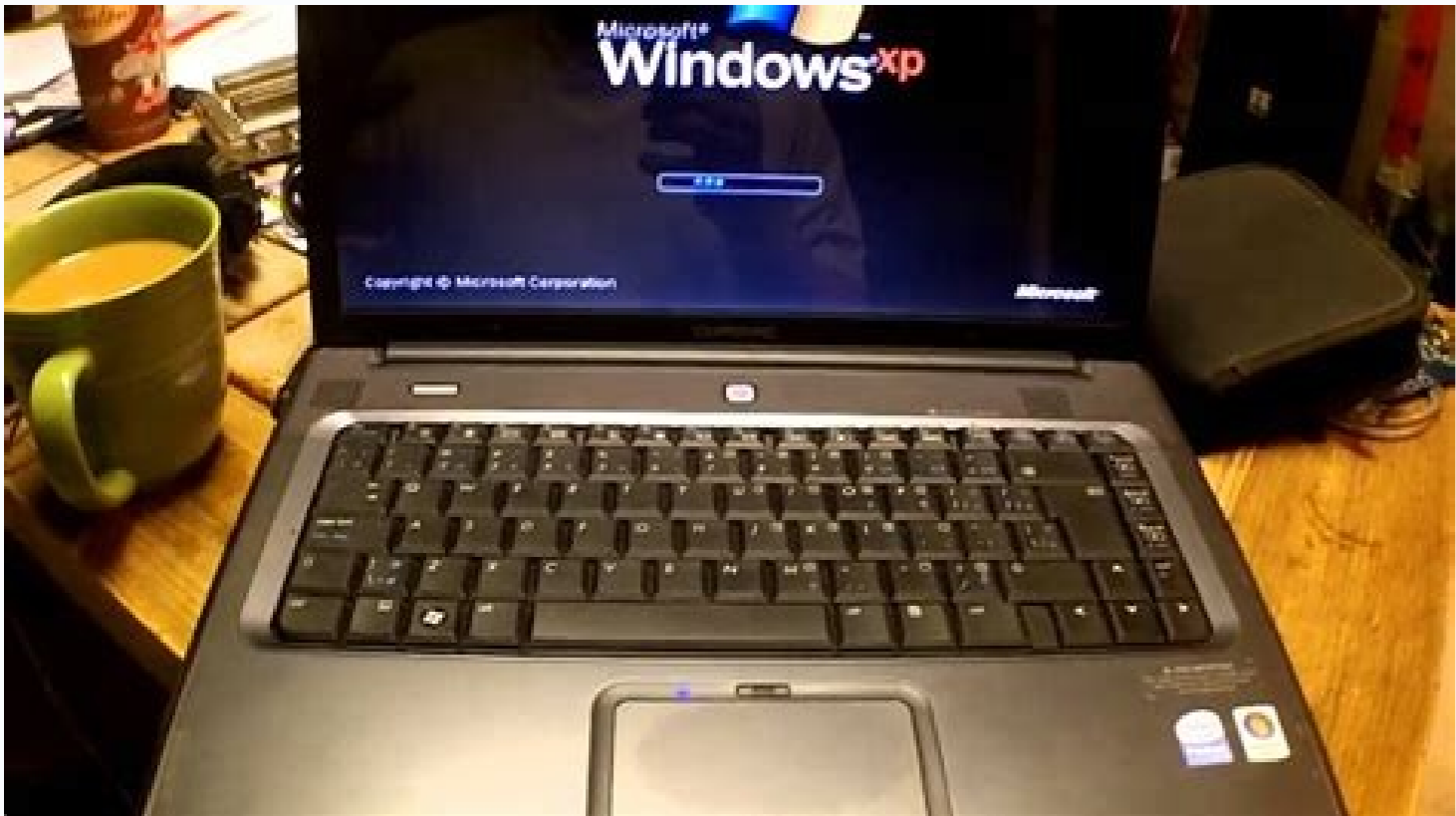
Best audacity version for windows 7. Audacity portable free download windows 7. Audacity free alternative. Is audacity completely free. Is audacity available for windows 7.